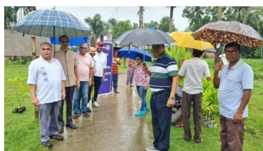
On a rainy day