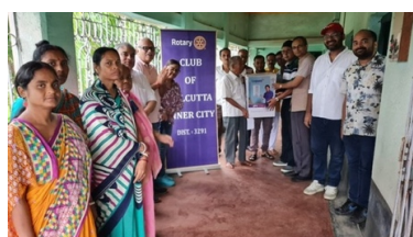
At RCC Ranjapur

Inner City also handed over a Livpure Water filter for safe drinking water of students of the school at Ranjapur.