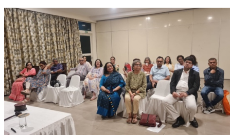
Members of Inner City at RWM