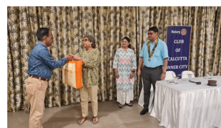
Teachers Day celebration